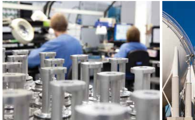
Each product is tested prior to leaving the factory