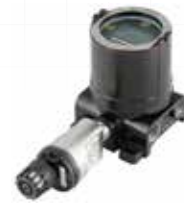
FlexVu® UD10 Universal Display with GT3000 Toxic Gas Detector