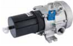
PointWatch Eclipse® IR Combustible Gas Detector