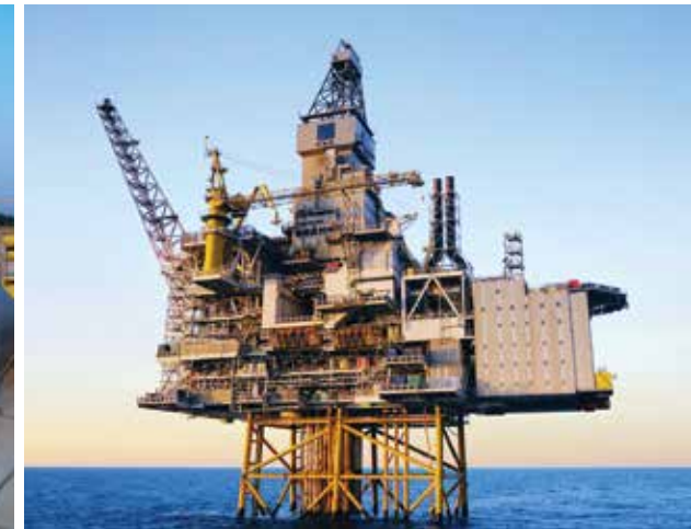
Solutions are tested before being commissioned