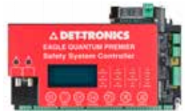
Eagle Quantum Premier® Safety System