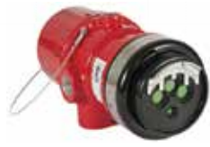
X3301 Multispectrum IR Flame Detector