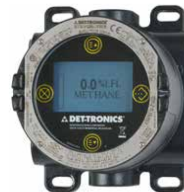
FlexVu® UD10 Universal Display