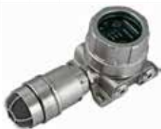
FlexSonic® Acoustic Leak Detector