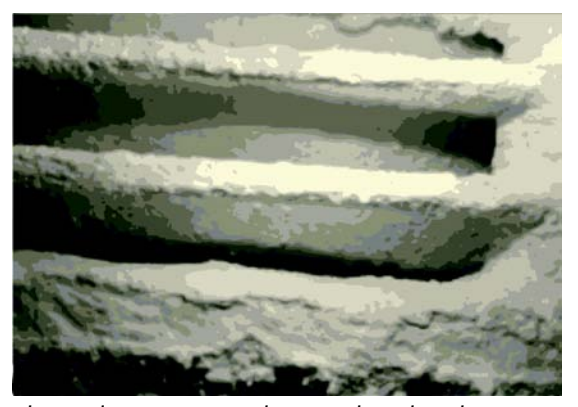
The application is very dusty and tends to have powder deposits everywhere.

By choosing the Rosemount 3301 Guided Wave Radar, this customer experienced increased bagging efficiency, reduced maintenance costs, and improved safety for the environment and employees.